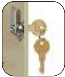
Disc-Tumbler Key Lock

To order, add corresponding letter to Model No. before the last two digits of the Model No. listed. (e.g. 2019010M03)