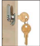
Disc-Tumbler Key Lock