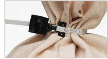
Customize to maximize identification and security!

EZ Crimp® Plastic Security Bag Seals feature a specially designed black plastic head that crimps easily using Seal Press (2400030100 sold separately). Unique interior metal seam eliminates tampering after seal is crimped providing maximum bag security. Super strong polytape strap measures 5mm x 10" and provides over 200 lbs. of tensile strength. Embossed surface holds bags tightly closed and eliminates slippage. Versatile seal design will fit either cloth or plastic cash bags. Bag seals are available unnumbered or with six-digit numbers printed on strap for easy identification and added security. Sold 250 per box.