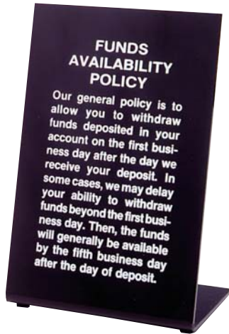
A Copy #1