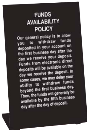
A Copy #2