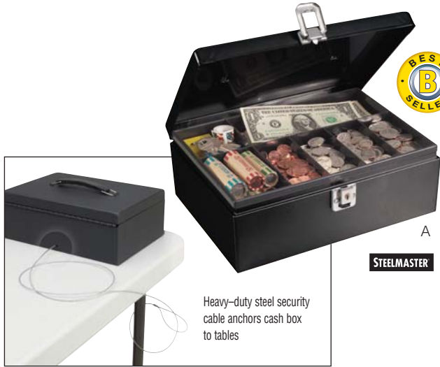
Heavy-duty steel security cable anchors cash box to tables